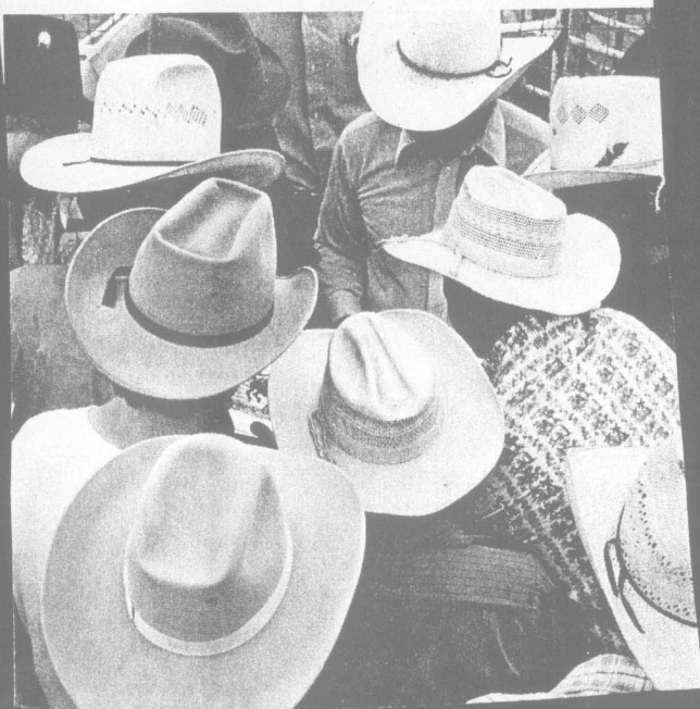
PHOTO 12-1. Conformity in dress and appearance often suggests conformity in attitudes and beliefs as well.